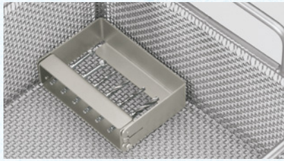
Fig. 1 Correct position of the bur block in the washer/disinfector.